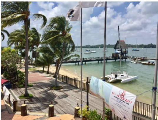
A view from the club looking out across the Serangoon channel - Malaysia in the distance. The thatched hut at the end of the jetty houses the race control functions

Serangoon channel that separates Singapore from Malaysia. Most sailing activities are conducted in the channel with careful observance of commercial shipping that uses the channel as access from ports both in Singapore and Malaysia to the Singapore Straits.