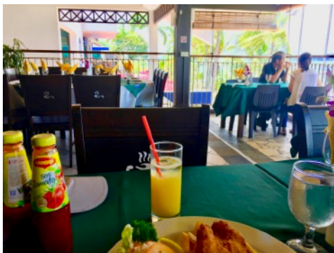
The restaurant at the clubhouse with views out to the channel

More longer course racing that entails sailing into Indonesian controlled waters requires a sailing permit for each boat and these need to be obtained from the Indonesian Navy prior to each race.