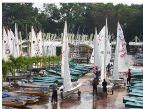
A busy day at the National Sailing Center

Singapore also has several sailing clubs and marina's scattered around the Island, including: the Changi Sailing Club, the Singapore Air Force Yacht Club, The Republic of Singapore Yacht Club, the SMU Sailing Club. As well as Sailing Clubs and training center, there are various other sailing centers including the