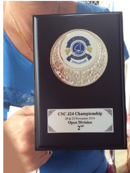
The Award Trophy

Thats all for this month folks.. A happy and prosperous new year to all readers of Spyglass Spyglass Editor